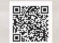
ภาษาไทย (泰國語)