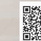
Tiếng Việt (Vietnamese)