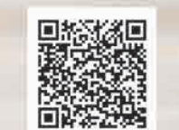
Bahasa Indonesia (印尼語)