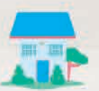
危機介入及支援中心 （芷若園）

由東華三院營辦的芷若園為成年性暴力受害人、面臨家庭暴力或其他危機的個人或家庭，提供全面的協助。芷若園提供的服務包括24小時熱線、為成年性暴力受害人及受虐長者提供危機介入／即時外展服務，並適切的支援短期住宿服務。